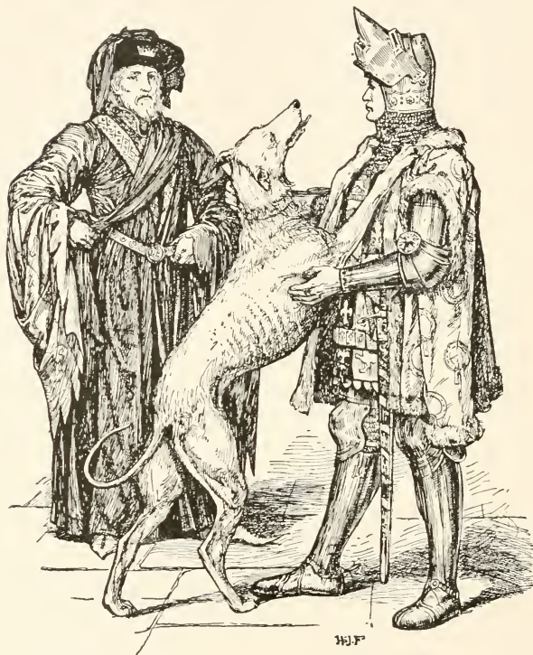
KING RICHARD & DUKE HENRY MATH THE GREYHOUND

play together in the hall, and Math would put his two huge paws on the king's shoulders. And when Math beheld the horses ready saddled, and being led to the spot where Richard and his cousin were standing, he